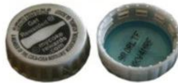
(examples of Coke codes)

caps and cardboard cartons. The value of each code varies from 5¢ to 38¢, depending on the product purchased. Simply enter the product codes at https://us.coca-cola.com/give/schools/ OR send them to school and PTO volunteers will enter the codes.